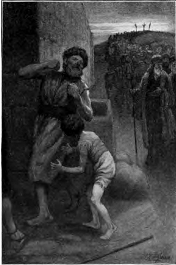
“HIS WICKED FACE DISFIGURED WITH RAGE AND PAIN.”