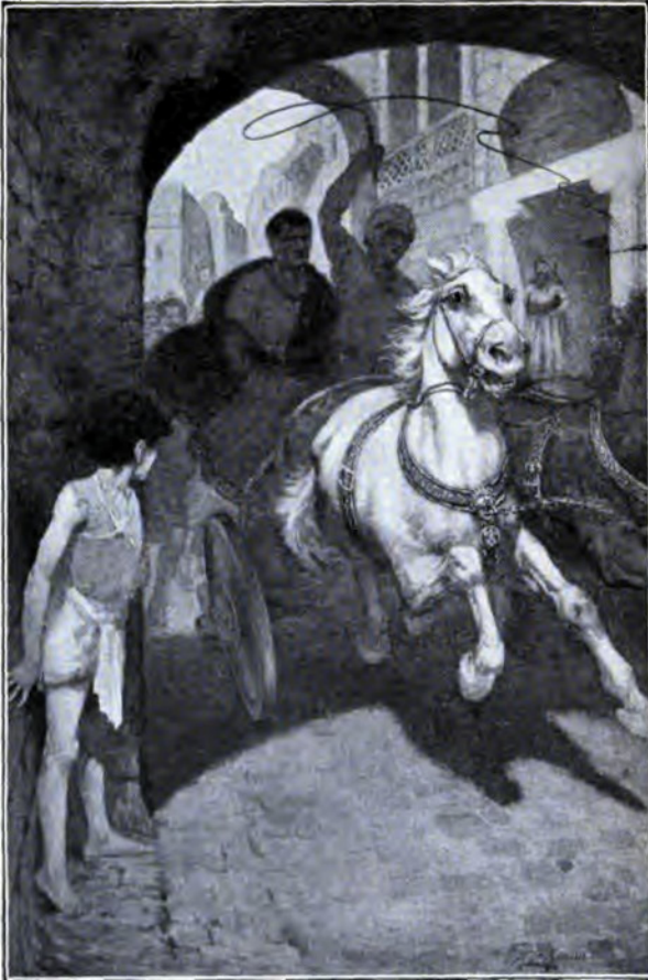
Frontispiece. “TOR FLATTENED HIMSELF AGAINST A CONVENIENT WALL.” See p. 31.